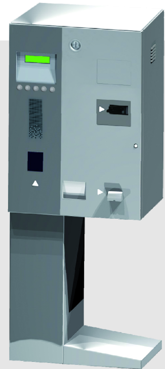
Figure with options